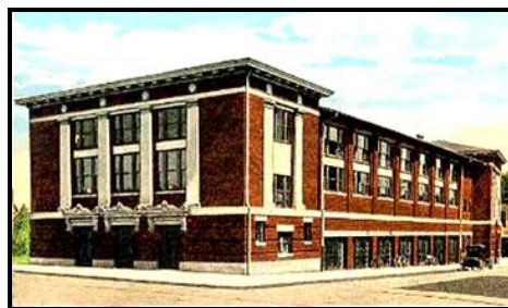
Municipal Building: Johnson City

Johnson City produced numerous other musical venues including the Big Burley Warehouse’s “Barn Dance,” concerts at “Mountain Home’s” Memorial Hall, Rich-R-Tone’s Recording Studio, WETB’s live broadcasts of local entertainers, the annual “Gray’s Station Fair,” and countless others. Johnson Citians can take great pride in the fact that their city has continuously fostered old-time music, with the rewards being a new bumper crop of talented musicians, both young and old, emerging onto the playing field almost daily -- keeping the tradition alive.