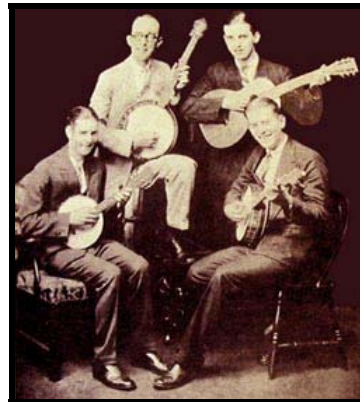
Jimmie Rodgers Entertainers

The epitaph on his statue at the Jimmie Rodgers Memorial Museum in Meridian, Mississippi reads... "His is the music of America. He sang the songs of the people he loved, of a young nation growing strong. His was an America of glistening rails, thundering boxcars, and rain-swept nights, of lonesome prairies, great mountains and a high blue sky. He sang of the bayous and the cornfields, the wheated plains, of the little towns, the cities, and of the winding rivers of America."